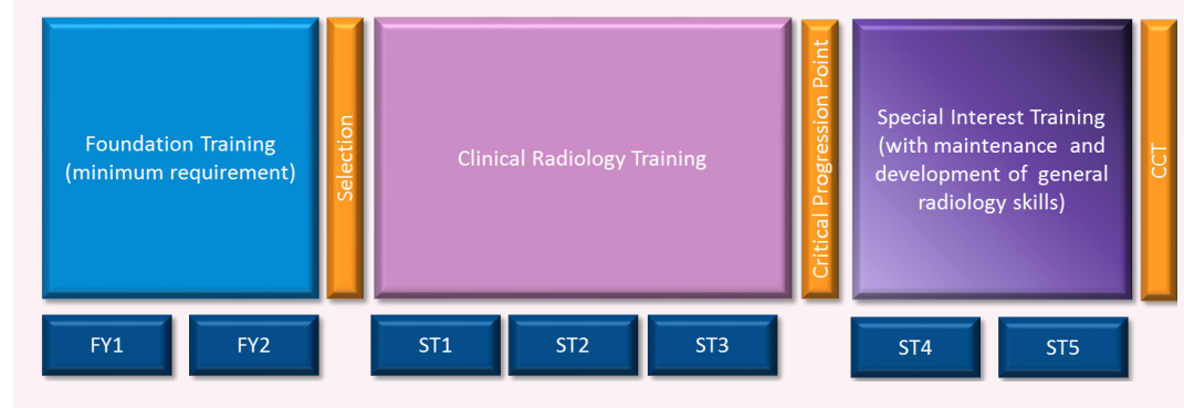
Figure 1: Training pathway for clinical radiology

This percentage breakdown is to be viewed as a guideline only and may be adapted to fit local service need and resources, as well as individual training needs (for example, the split may be slightly different in a large specialist centre compared to a district general hospital). A certain degree of flexibility in these indicative times is necessary in order for it to be feasible to deliver the curriculum in the wide range of training environments across the UK.