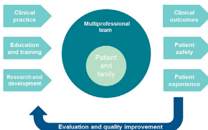
Figure 1. The cycle of patient- and family-focused quality improvement in paediatric radiotherapy

The intention was to draw together best practice from existing authoritative guidelines, and supplement this with the collective experience of working group members to produce an easy-to-use guide for paediatric radiotherapy. This encompasses continuous improvement in all aspects of the patient pathway, together with education of the multiprofessional team and research aimed at improving current practice (see Figure 1 below).